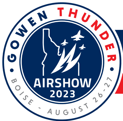
EXHIBIT BOOTH ONLY