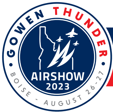
EXHIBIT BOOTH ONLY